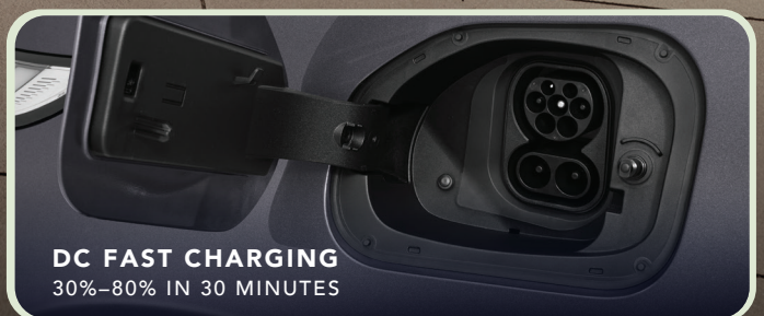
DC FAST CHARGING 30%-80% IN 30 MINUTES