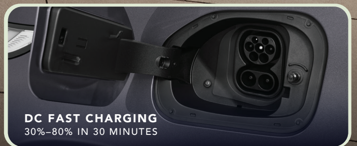
DC FAST CHARGING 30%-80% IN 30 MINUTES